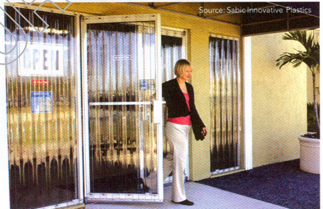
Lookout Shutters installs polycarbonate guards over windows and doors for storm protection.

The material was used earlier this year to retrofit a section of the Grove Street Bridge deck over I-94 in Michigan. An ECC slab replaces an expansion joint to form a continuous deck. "The ECC material has promise for solving some of the deck durability issues we face, such as premature cracking," says Steve Kahl,