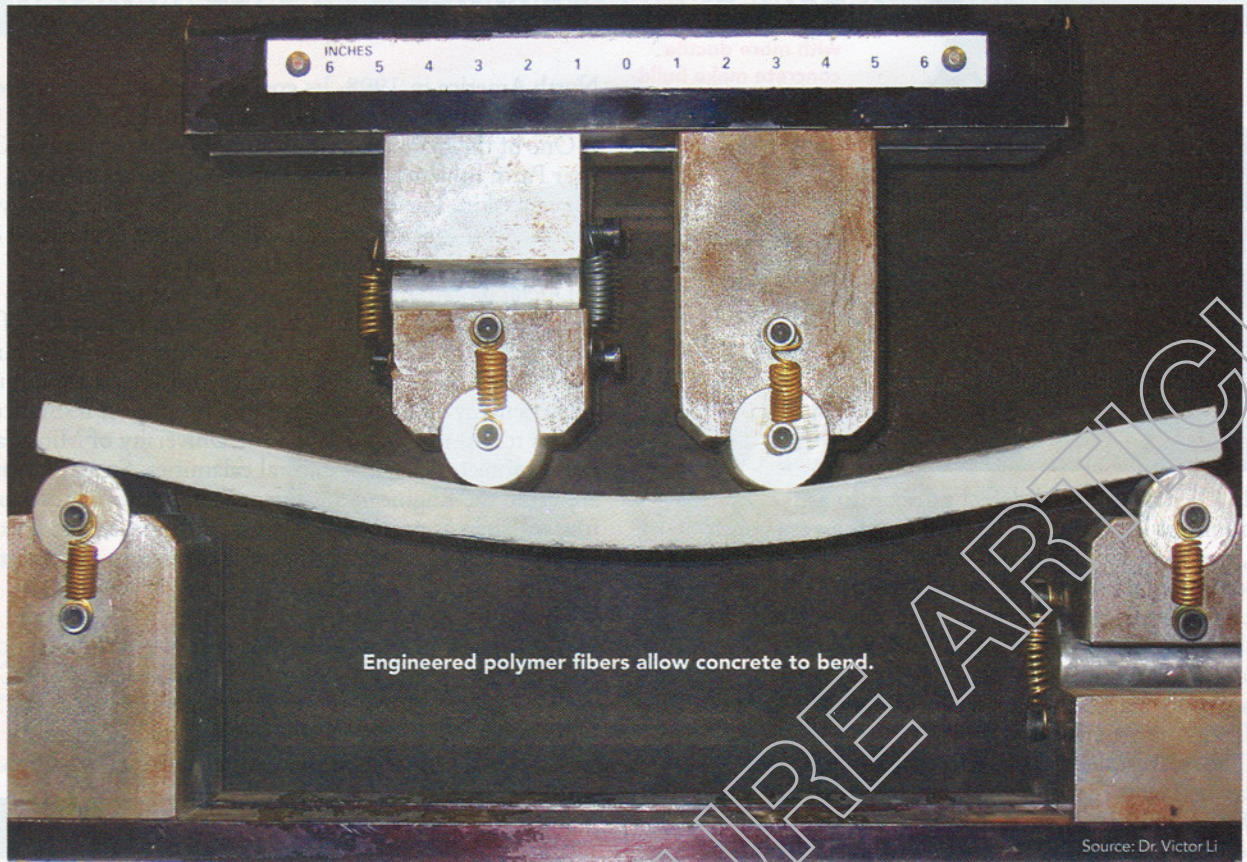
Engineered polymer fibers allow concrete to bend.