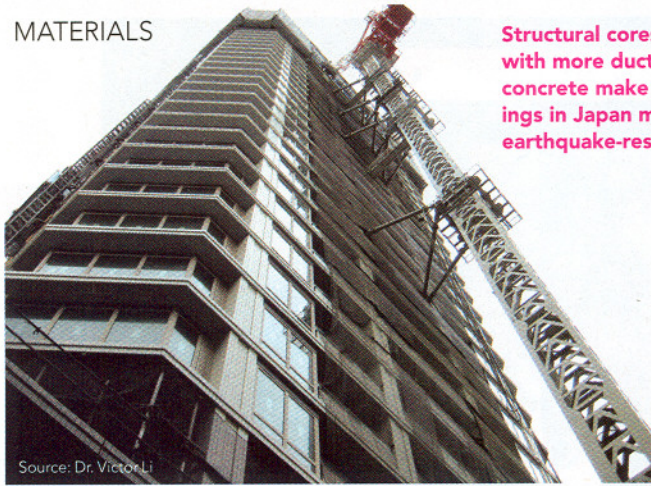
Structural cores made with more ductile concrete make buildings in Japan more earthquake-resistant.

materials. "When an initial defect grows into a crack due to a large amount of load, the crack will grow in a very controlled manner," says Dr. Li. "The crack will be very much less than the dimension of a human hair or less than 100 microns. The load is carried across that crack through the bridging fibers. These fibers, in turn, carry the load back into other parts of the composite."